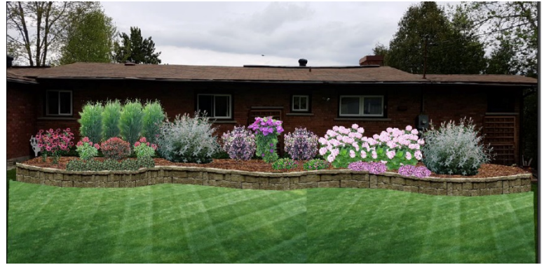
Example of a Computer Generated Illustration